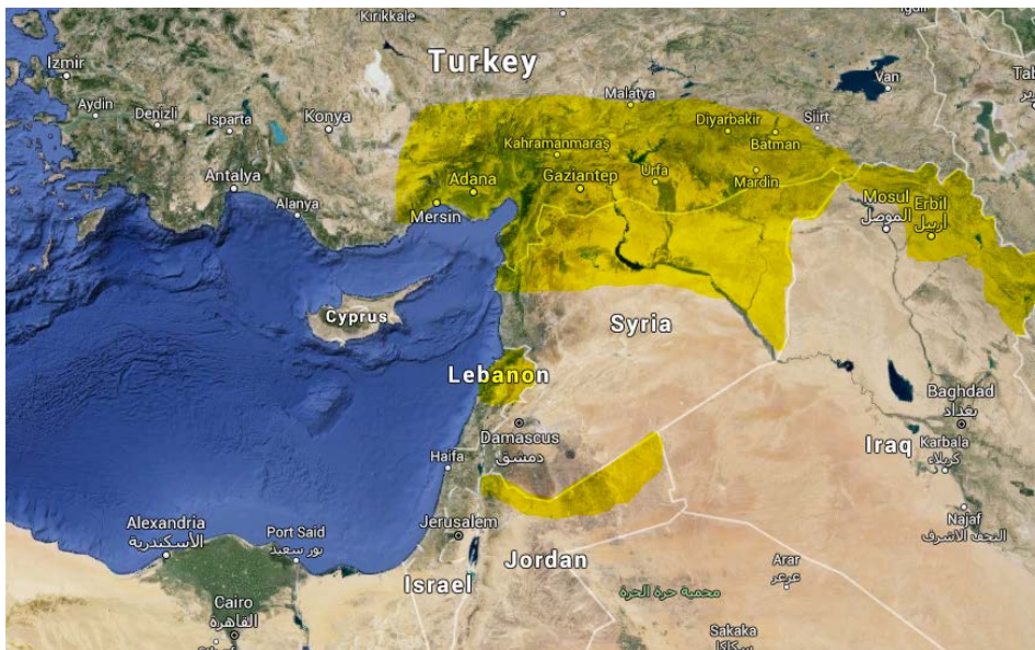
Areas of high population density of displaced Syrians

The majority of displaced Syrians are not living in camps