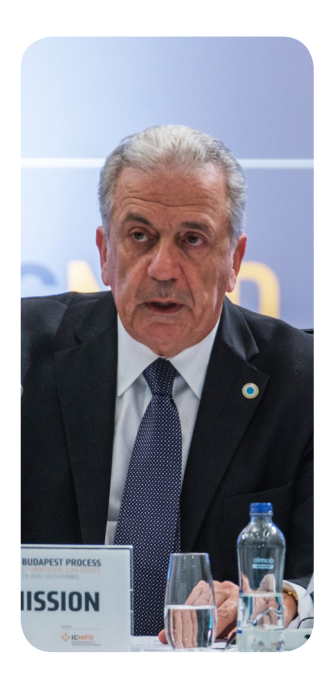
Dimitris Avramopoulos Commissioner for Migration, Home Affairs and Citizenship European Commission

In this, we can build on the results we have already achieved between the EU and important countries. Together with Turkey for example, we have delivered on what matters most: saving migrants' lives by preventing the use of irregular and dangerous migration channels, and fighting effectively against smugglers and traffickers.