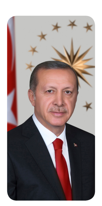
Recep Tayyip Erdoğan President of the Republic

The current system failed to bring solutions to conflict or instability or even for the reasons that trigger people to migrate. In such an era when distances have become meaningless, the fate of Europe cannot be considered apart