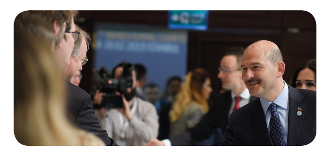
H.E. Mr Süleyman Soylu, Turkey's Minister of the Interior, greets all participating Ministers and other high-level participants on 20 February.