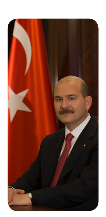
Süleyman Soylu Minister of Interior of the Republic of Turkey

As a country, by virtue of our geographical location, we are a destination and transit country, which lies at the crossroads of migration routes. In such a po-