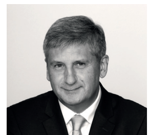
Director General Michael Spindelegger

Making migration and mobility of people orderly, safe and regular, including through the implementation of planned and well-managed migration policies.