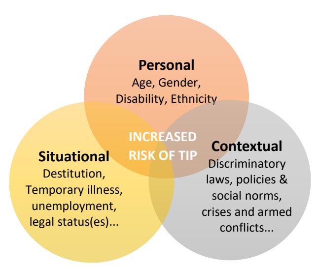
Figure 1: Intersection of vulnerability factors to increase risk of TIP

As noted above, vulnerability is commonly associated to individual characteristics and situations that - in specific contexts - will increase the risk or threat of a person to be trafficked. Risk is on the contrary often referring to the threats that a person or a particular group may be exposed to, with an explicit external focus on the presence of such threats in certain contexts or situations. It is important to recognise that it is the intersection of vulnerability factors that increases the risk of TIP (see Figure 1). Therefore, to reduce the risk of TIP, vulnerability must be understood addressed.