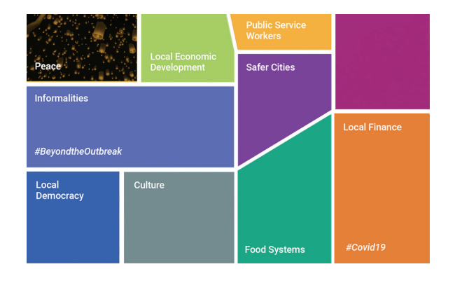
UCLG LIVE LEARNING EXPERIENCE KNOWLEDGE HUB

The Live Learning Experience Knowledge Hub, aggregating under one online platform the main ideas